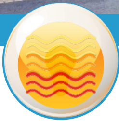
Energy Saving Insulation