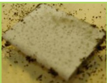
The uncoated panel is covered with mold growth.

Energy Protect™ coating is hydrophobic, meaning it repels water, so there is not enough moisture on or in the coating film for mold and mildew to grow. The mold resistance comes naturally, without the use of any dangerous biocides.