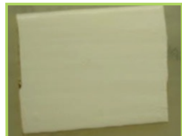
The Energy Protect™ coated panel has zero mold growth.

ACTUAL PHOTOS FROM ASTM D5590 TESTING FOR RESISTANCE TO MOLD GROWTH