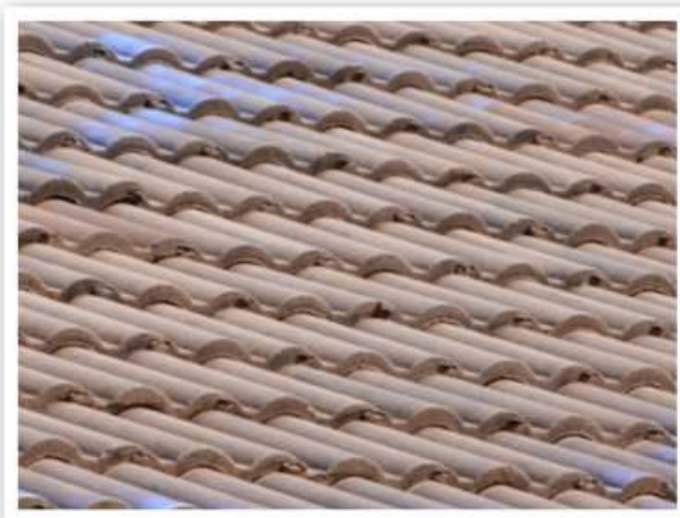
Crystal goes on white, and dries to a beautiful, clear protective finish.