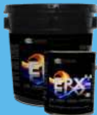
Syneffex™ EPX-H2O up to 400F (204C)

Clear acrylic Insulation Corrosion Resistance 1-part system Apply w/ sprayer or brush Direct-to-metal