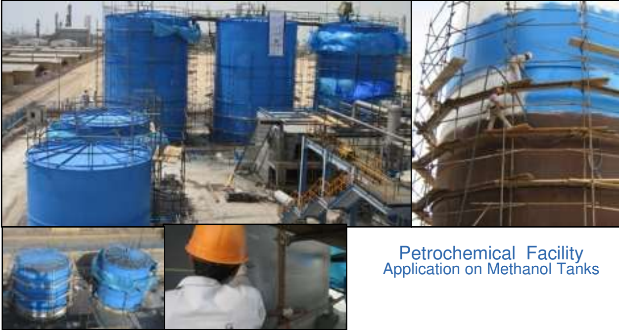
Petrochemical Facility Application on Methanol Tanks

Syneffex™ technology was chosen by a large Middle East Petrochemical Facility to stop product loss by vaporization of methanol and to provide effective insulation in a high humidity climate.