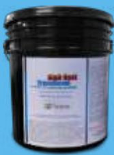
Syneffex™ High Heat up to 400F (204C)

Clear acrylic Insulation Corrosion Resistance 1-part system Apply w/ sprayer or brush Direct-to-metal