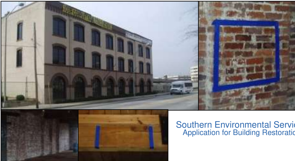
Southern Environmental Services Application for Building Restoration

Syneffex™ High Heat was applied to the facility's methanol tanks, and over coated with a blue paint. Syneffex™ provides a thin film insulation that performs in high humidity environments and offers UV and corrosion resistance.