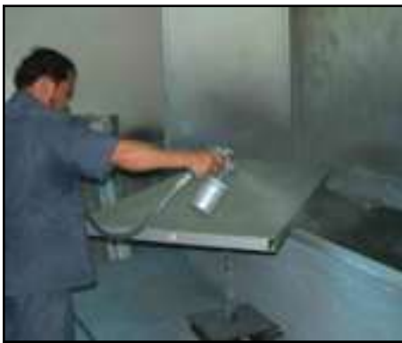
Aluminum Panels - Airport Facility