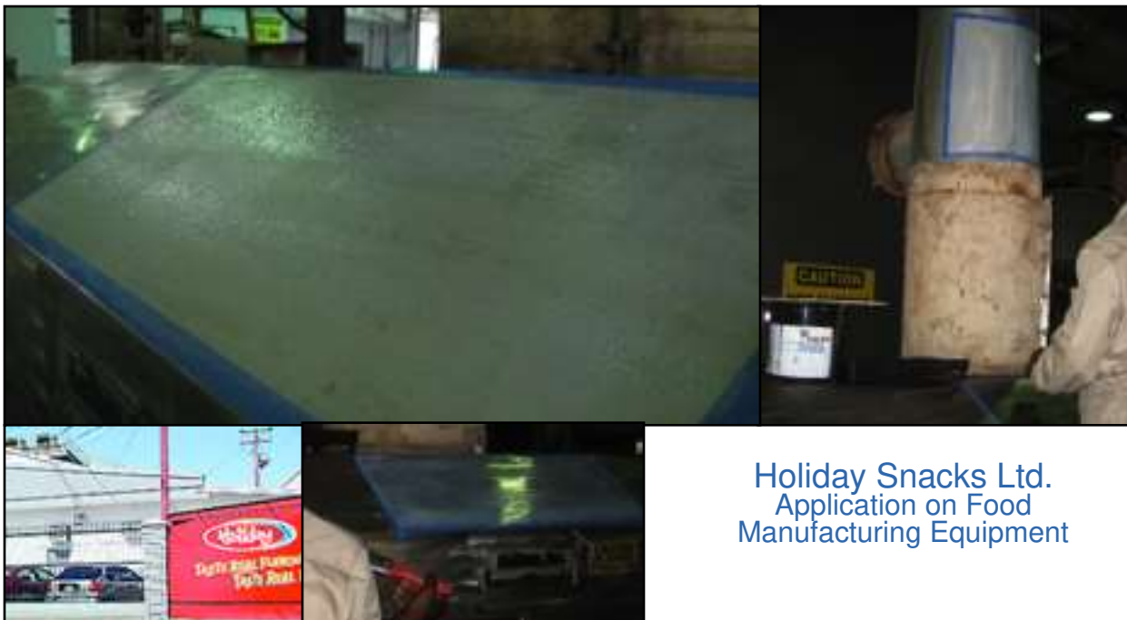
Holiday Snacks Ltd. Application on Food Manufacturing Equipment

Syneffex™ High Heat (3 coats) and white finish coat (1 coat) were applied to the exterior of the large columns. Syneffex™ provided protection from corrosion while reducing energy use by insulating the equipment.