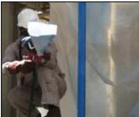
Steam Lines - Chemical Plant