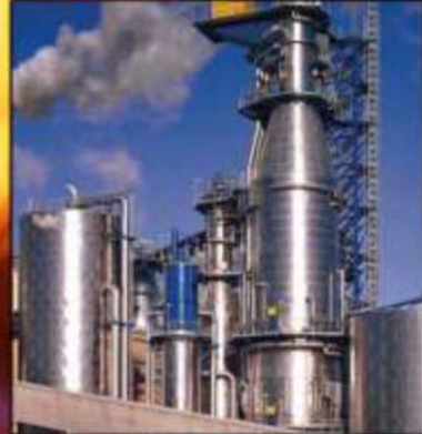
Pipes, Tanks, Metal Structures