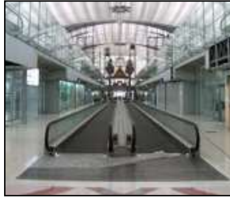
Airway Bridges - International Airport