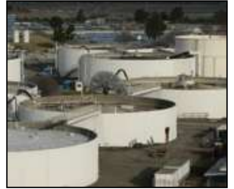
Concrete Tanks - City Waste Water Facility