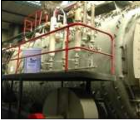
Steam Boiler - Textile Facility