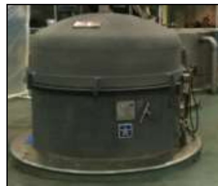
Yarn Dye Machine - Textile Facility