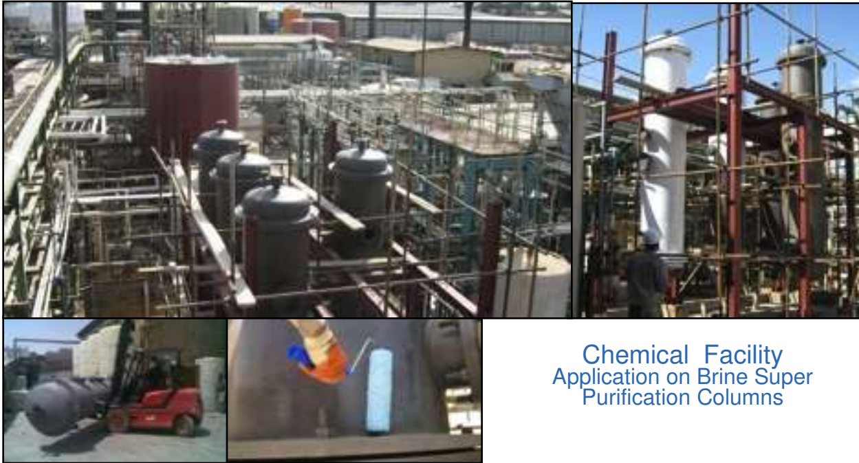
Chemical Facility Application on Brine Super Purification Columns

Syneffex™ technology was chosen by a large Middle East Chemical Production Facility to insulate and protect brine super purification columns.