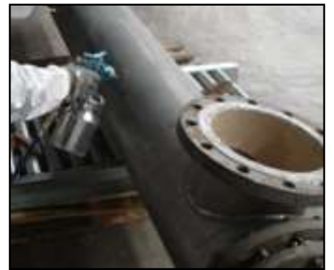
Heat Exchanger - Brewery