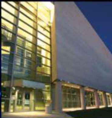
Building Energy Efficiency