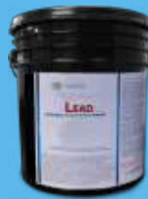
Syneffex™ LeadX Clear lead encapsulation

Clear acrylic Lead abatement Mold resistant 1-part system Apply w/ sprayer or brush Environmentally friendly