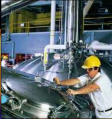
Heat Process Equipment