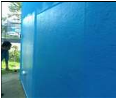
Building Exterior - Manufacturing Plant