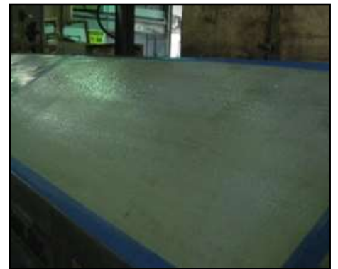
Industrial Oven - Food Manufacturer