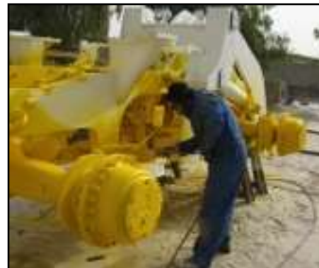
Vehicle Protection - Manufacturer