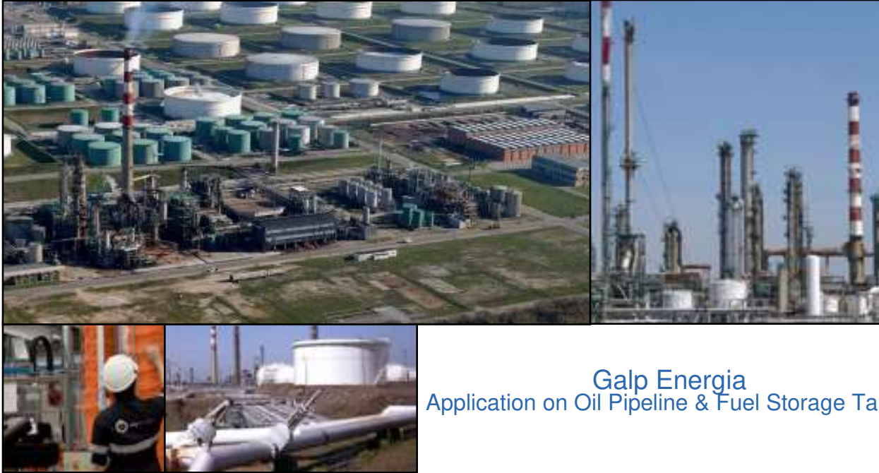
Galp Energia Application on Oil Pipeline & Fuel Storage Tanks

Syneffex™ technology was chosen by Galp Energia for insulation and corrosion control of equipment at their Matosinhos Refinery in Portugal.