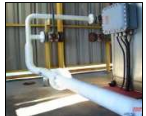
Oil Pipelines - Offshore Platform