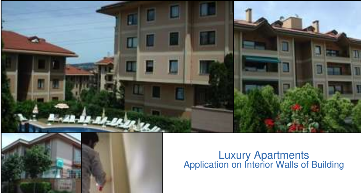
Luxury Apartments Application on Interior Walls of Building

Syneffex™ technology was chosen to increase energy efficiency and reduce costs for the residents of a luxury high rise apartment complex in Istanbul, Turkey.