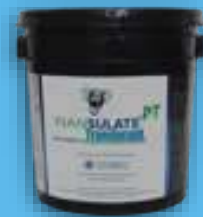
Syneffex™ PT up to 256F (125C)

Clear acrylic Lead abatement Mold resistant 1-part system Apply w/ sprayer or brush Environmentally friendly